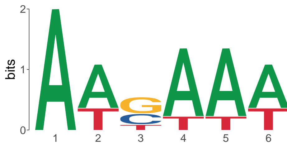
Figure 2: Sequence logo of an Information Content Matrix